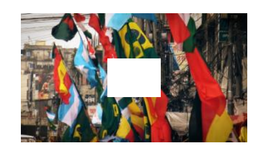
Football fever hits Dhaka

In the fall of 2017, the Permanent Court of Arbitration in The Hague ruled that two international clothing brands which signed the Accord were required to pay over 2 million USD to correct hazardous conditions in more than 200 supplier factories. The two unnamed brands had continued to source from suppliers that refused to correct Accord-identified hazards, prompting the arbitration claim by the international union signatories of the