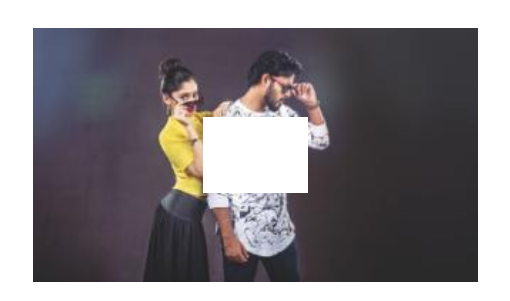
A rendezvous with Siam & Puja